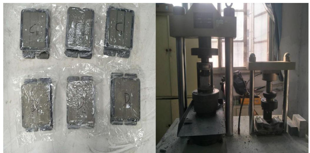
Figure 4. Grouting material test block.

The compressive strength of grouting materials cured at low temperature in the same environment does not meet the specification requirements, and the early strength is greatly affected by the low temperature environment, reaching only about 50% of the specified strength in the specification; However, with the slow growth of its later strength, it reached 90% of the specified strength at 28d". However, the compressive strength of grouting material test blocks cured in the curing room all meet the specification requirements. This shows that the early strength of grouting material has great influence on its strength growth. Early strength cement can be used or heat preservation and curing measures can be taken to make the early strength reach the specification.