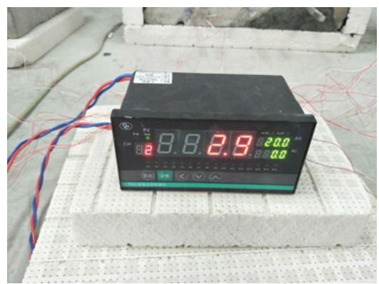
Figure 2. THJ multi-channel itinerant detector.

Main equipment: The temperature detection adopts THJ multi-channel touring detector as shown in Figure 2 and cement mortar bending and compression resistance test integrated machine.